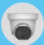
Temperature thermographic solutions to suit your requirements